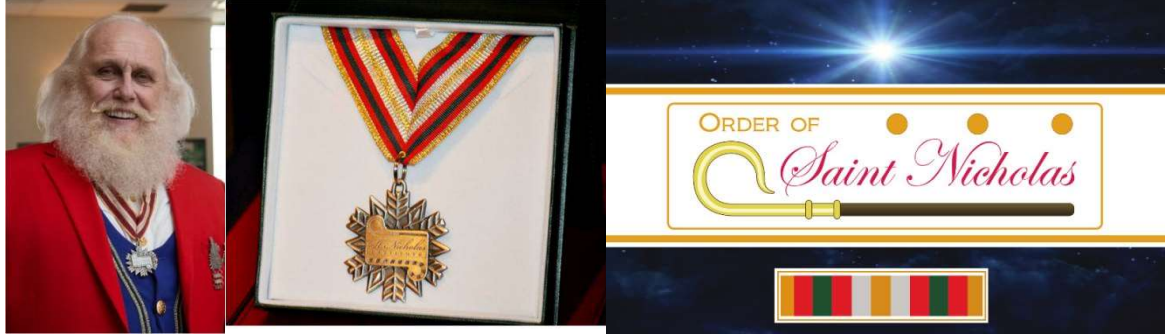
Order of St. Nicholas Medal SNI and ribbon (above at left and center), and the Order of St. Nicholas Flag (above, right) are protected by Copyright 2017, St. Nicholas Institute. All Rights Reserved.

After completing four years with the Saint Nicholas Institute, each participant is received into the Order of St. Nicholas, by means of a formal conferral of the Order of St. Nicholas Medal ("Ordinis Sancti Nicolai Numisma"). See images, below.