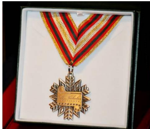
Order of St. Nicholas Medal & Ribbon (shown above).

Ordinis Sancti Nicolaus Numisma © ("Order of St. Nicholas Medal"): The medal (pictured above) is to be presented to all members of the St. Nicholas Institute Alumni who have completed four year of formation.